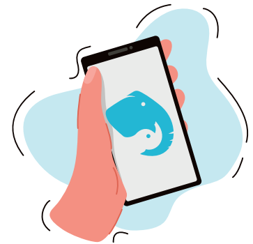
Digital Engagement Engine