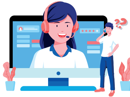
High Touch Navigation